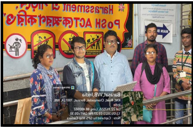
Inauguration of wall art