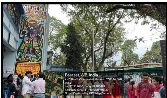
Mural painting on inner wall of college