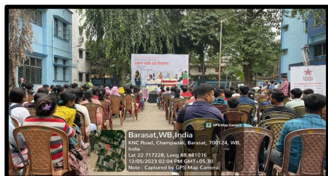
Spectators to the inauguration event