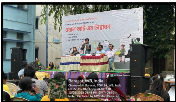
Talks by visiting dignitaries