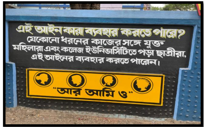
Mural on the outer wall of the college