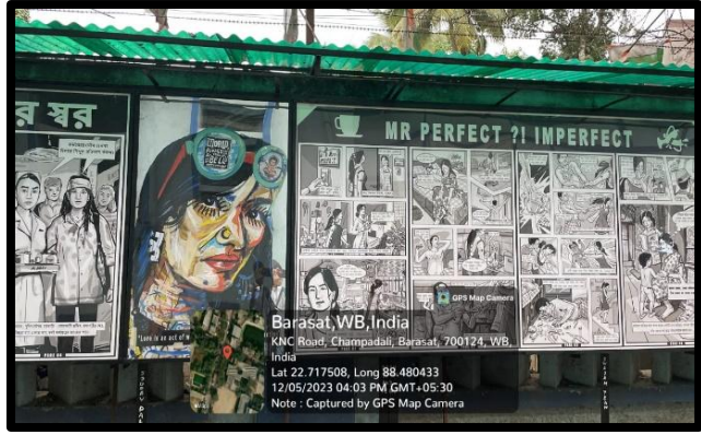
Mural painting on stories on gender harassment in work place